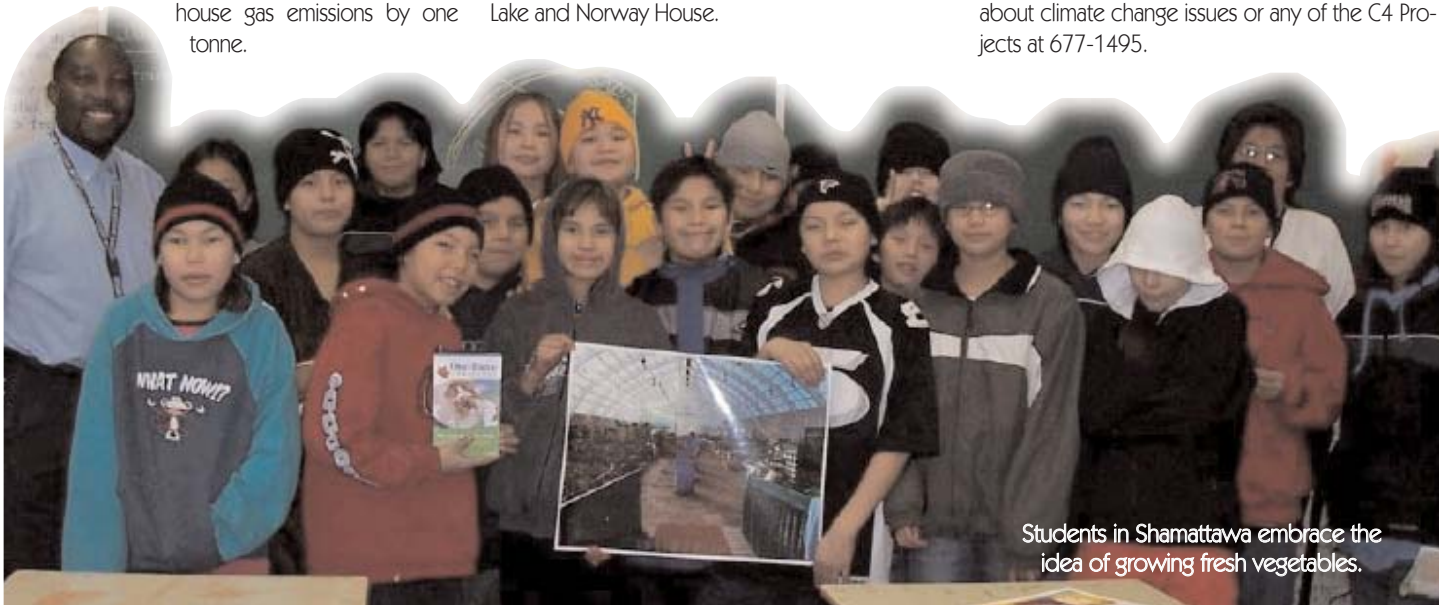
Students in Shamattawa embrace the idea of growing fresh vegetables.