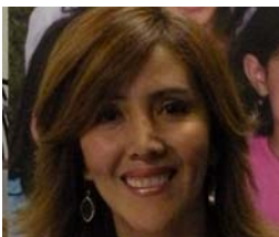
MILLY YUPANQUI SETTLEMENT SERVICES